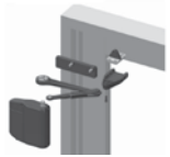
Operator Non-Handed Shown Push Side Mounting Parallel Arm